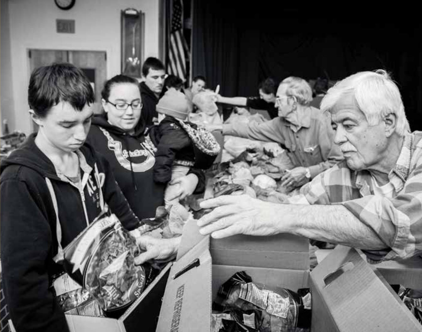
Volunteers distribute cabbage and spinach from local farms at a Pantry On the Go event in Essex, MD.