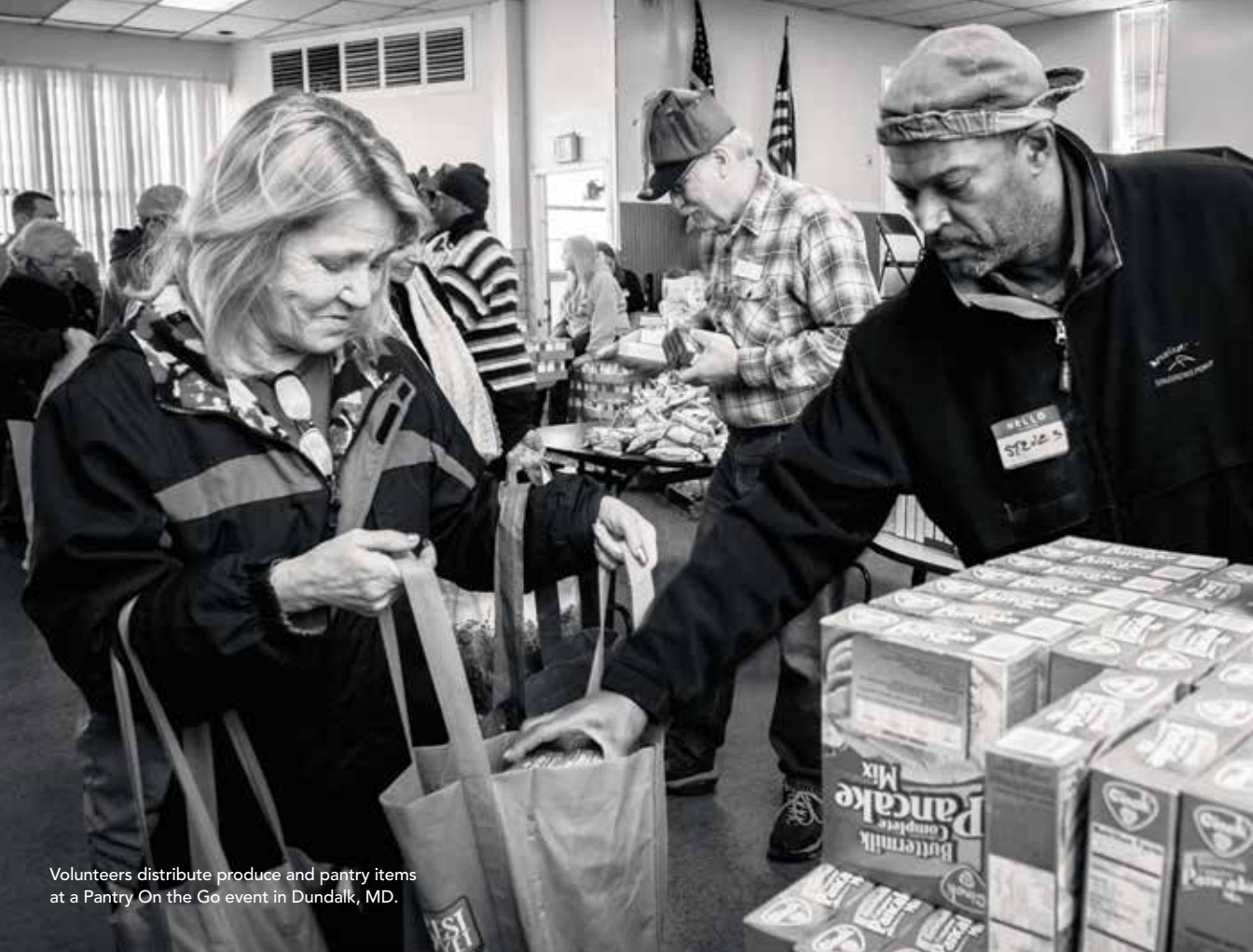
Volunteers distribute produce and pantry items at a Pantry On the Go event in Dundalk, MD.