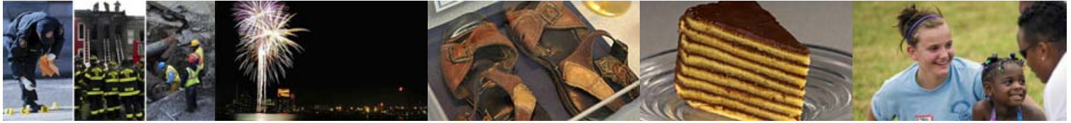
Overtime pay's impact on city